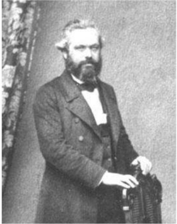
• Karl Marx